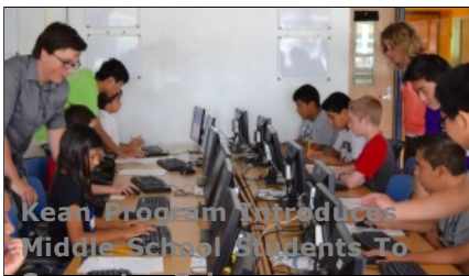
Kean Program Introduces Middle School Students To Computer Science