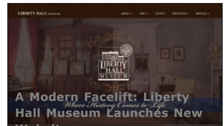
A Modern Facelift: Liberty Hall Museum Launches New Website

Kean University Welcomes Local Educators At Annual