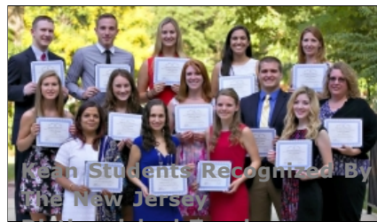
Kean Students Recognized By New Jersey Distinguished Teacher Awards